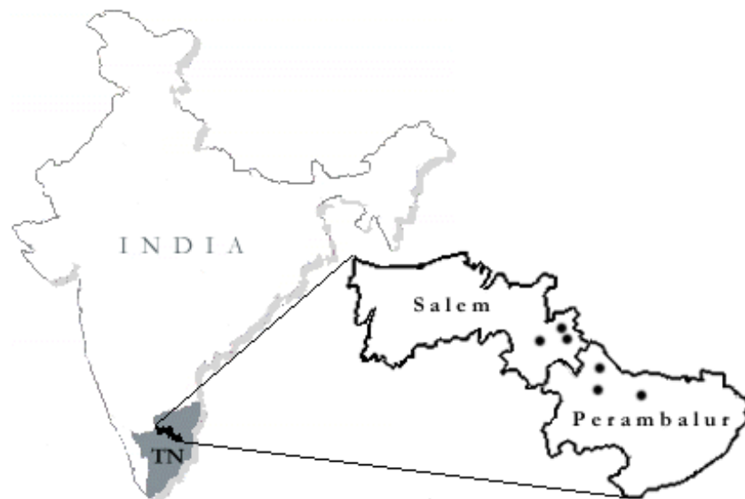
Figure 1 Map of surveyed villages in Salem and Perambalur districts of Tamil Nadu (TN), India (India map courtesy of www.theodora.com/maps , used with permission)