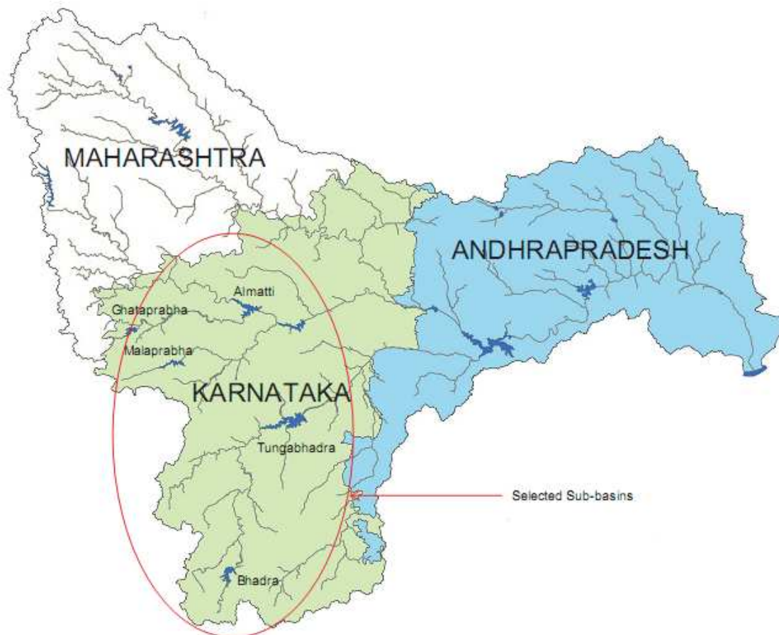
Figure 1. The map of Krishna river basin showing the study area

Data on agricultural production systems were collected from the farmers of the Krishna river basin area of the northern Karnataka state in India from December to March 2008 by face-to-face interview method using a structured questionnaire. The Krishna river basin constitutes 8% of the total geographical area of India and flows through three Southern Indian states: Maharashtra, Karnataka and Andhrapradesh. This part includes four sub-basins, namely Lower Krishna, Ghataprabha, Malaprabha and Tungabhadra. Fig. 1 shows the map of the Krishna river basin. About 77% of the total basin area is cultivable (203,000 Km 2 ) with an irrigation potential of 47,200 km 2 (IWMI, 2007). The majority of the basin area is arid or semi arid and faces high water scarcity. The per capita total renewable water resources availability of the basin is estimated to be 1,133 m 3 (Amarasinghe, et al., 2005). More than 90% of total water in Krishna River is used for irrigation. The cropping pattern in this basin is very diverse with field crops constituting the principal share. In this study, the villages and farmers within villages were selected randomly. The production details of 120 farms were collected and used in the DEA analysis.