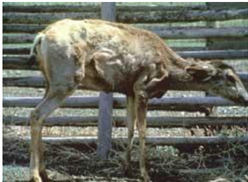
Figure 1. Mule deer doe with CWD in Wyoming.