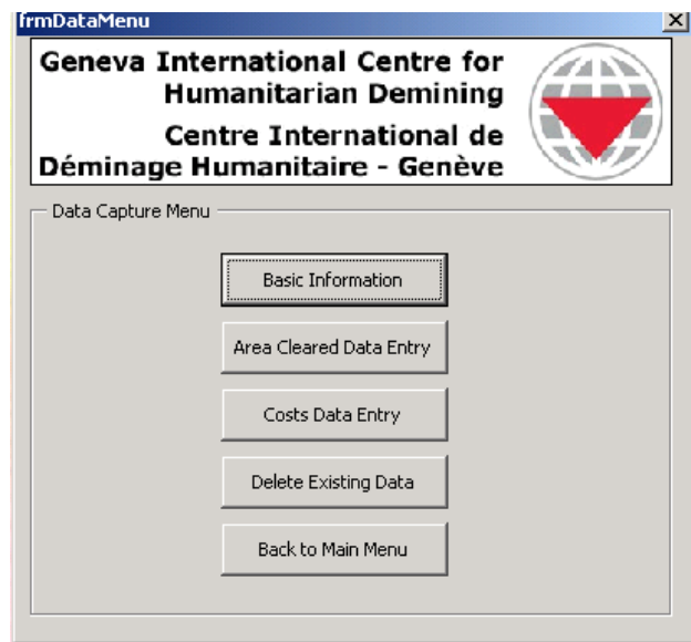
Figure 2: CEMOD Data Capture Menu

In the ‘Costs Data Entry Menu’, users are asked to enter data on the actual or projected costs of the mine clearance project. The costs in the model are grouped into four categories: staff salaries; staff allowances; consumables and running costs; and capital equipment. Within each of these cost categories there is no restriction on how many cost items are specified. Thus, the model can handle both analyses of past costs, based on detailed budgets, as well as projected costs where there might be rather less detail available. For each cost item, the user is asked to specify a name or description for the item, the number of items used, and the unit cost per item per year.