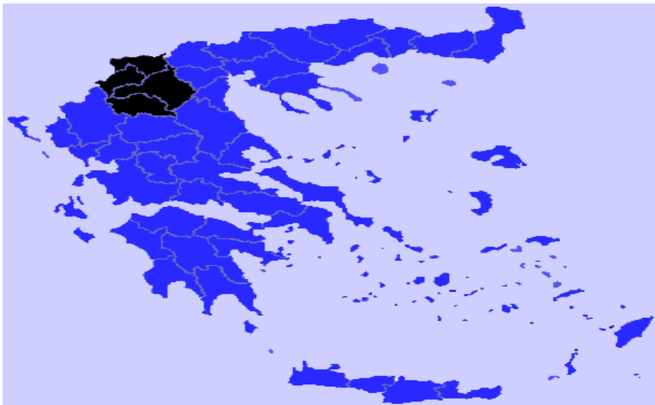
Figure 2. Dytiki Makedonia Region

The Dytiki Makedonia region is one of the thirteen Greek regions located in the northwest part of the Greek state and especially in the western district of Macedonia. The region of Dytiki Makedonia includes four separate prefectures: (a) Florina, (b) Grevena, (c) Kastroria, and (d) Kozani. From a geographic point of view the Dytiki Makedonian region holds a central position in the general area of West Balkans as it represents the natural gate of Greece to the northwest borders and especially to Albania and to the Former Yugoslavian Republic of Macedonia (FYROM). The other Greek regions which are adjoining to the Dytiki Makedonia region are the region of Thessaly in the south, the region of Central Macedonia in the east and the region of Epirus in the West. The landscape of the region mainly consists of highlands (69.2%), forest areas (26.0%), rangelands (43.0%) and cultivations or fallow lands (24.0%). The Dytiki Makedonia region includes overall 9,451.6 Km 2 or 7.2% of the total Greek area (NSSG, 2003). Figure 2 shows the location of Dytiki Makedonian Region as well as the four Prefectures within the study area.