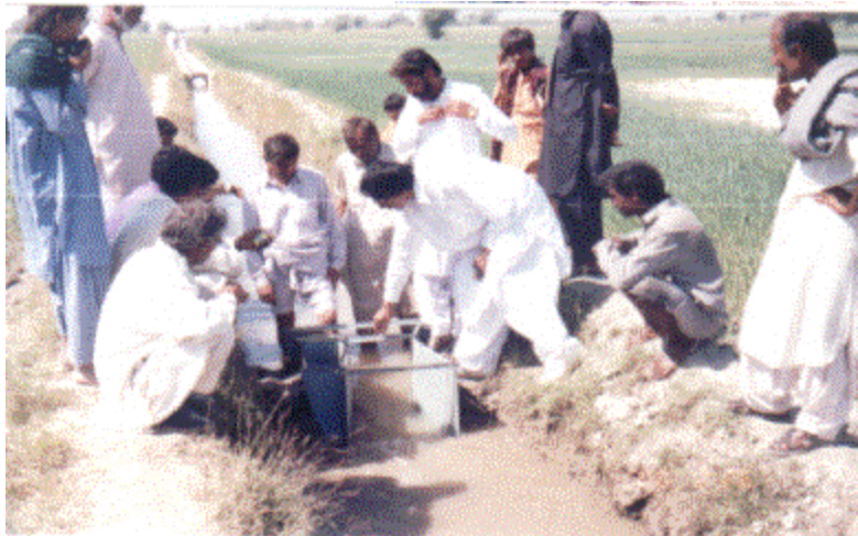
Photo 1. Discharge Measurement Training.