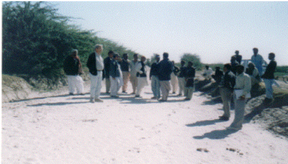
Photo 2. Walk thru Survey.