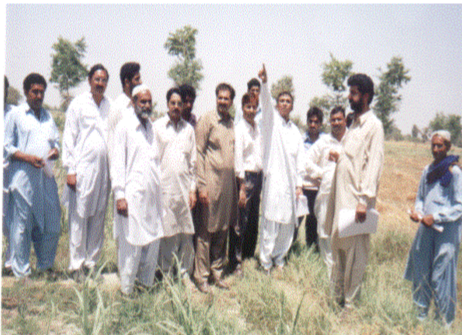
Photo 3. Crop Assessment Training.