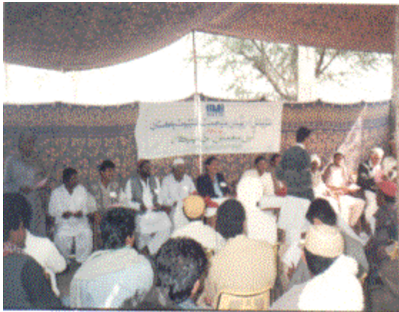
Photo 4. Organizational Management Training.

In the first phase of the project, IWMI field team had encountered several problems while organizing the new farmer organizations at pilot distributaries. The water users were told that the distributaries are being privatized, meters would be installed on the outlets and price of irrigation water would be very high, and so on so forth. In fact the lower level irrigation officials spread these rumors. Learning lessons from past, awareness training workshops were organized at various places for IPD officials. The training workshops to IPD officials resulted in no resistance, rather they were supportive to the field team. Subsequently