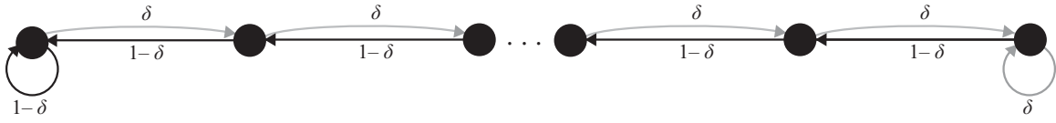
Figure 2: The unbalanced line, which demonstrates that a network may not converge to truth even if every agent's incoming trust is bounded. Agents are numbered from left to right.

One thing that goes wrong in this example is that the central agent receives an high amount of trust relative to the amount given back to others, making him unduly influential. However, this is not the only obstruction to convergence to true beliefs. There are examples in which the trust coming into any node is bounded relative to the trust going out, and there is still an extremely influential agent who can keep society's beliefs away from the true state. This shows how indirect weight can matter.