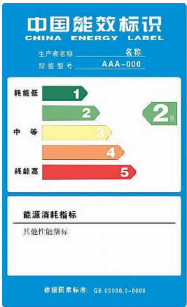
Figure 2 China Energy Label