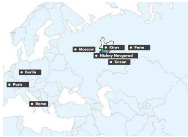
Figure 1. The Kirov region.

The agro industrial complex presents a considerable share in the economy of the region (about 11% of the region GDP) with 7,2% of the economically active population. There are about 2 thousand agro industrial and farming enterprises. The main activities are flex and crop production and processing, milk processing, animal breeding.