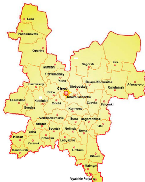
Figure 3: Administrative division of the Kirov region.

The following ranking results have been received. The top six municipal districts for the development of rural tourism are Kymyony (6,625), Kotelnich (6,150), Sovetsk (6,150), Nagorsk (6,100), Urzhum (5,750) and Slobodskoy (5,600). They are situated not far from the city of Kirov, there are railway and bus services between Kirov and these areas. These areas also have