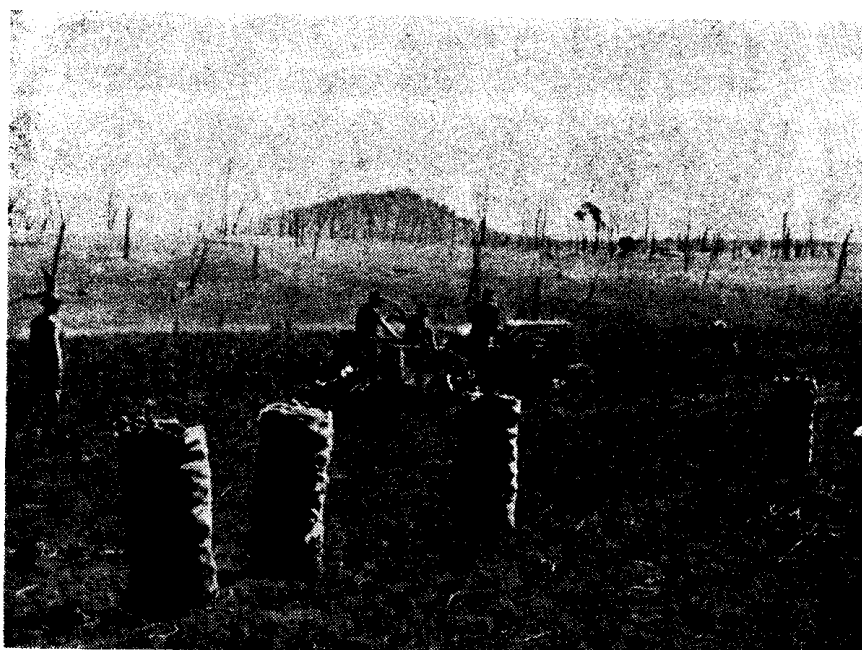
Potato Digging Machine at Work—Guyra District.

However, the withdrawal of allied servicemen from Australia spelt a diminished demand while the prospect of increased numbers of Australian ex-servicemen taking up vegetable growing, and the abandonment of growing by contract, were considered likely to create grave problems. As previously indicated, prices for vegetables during the war years were considerably higher than in pre-war times, and as there is practically no export market for fresh vegetables, it was anticipated the industry would be one of the first to be adversely affected by the change-over from war to peacetime conditions.