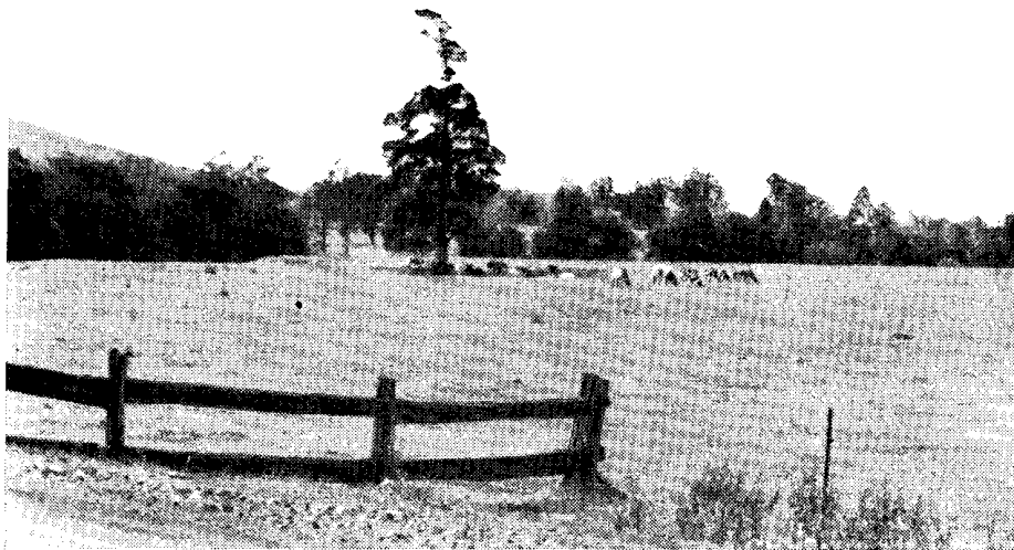
A Striking Contrast between Typical Breeding Country in Sub-Region II and High Class Fattening Country in Sub-Region III.