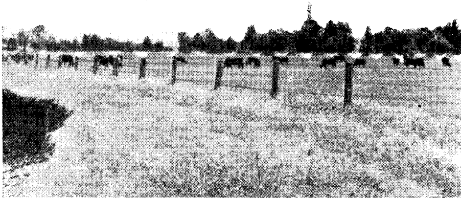
Choice Spray-Irrigated Fattening Country in the Gloucester District.