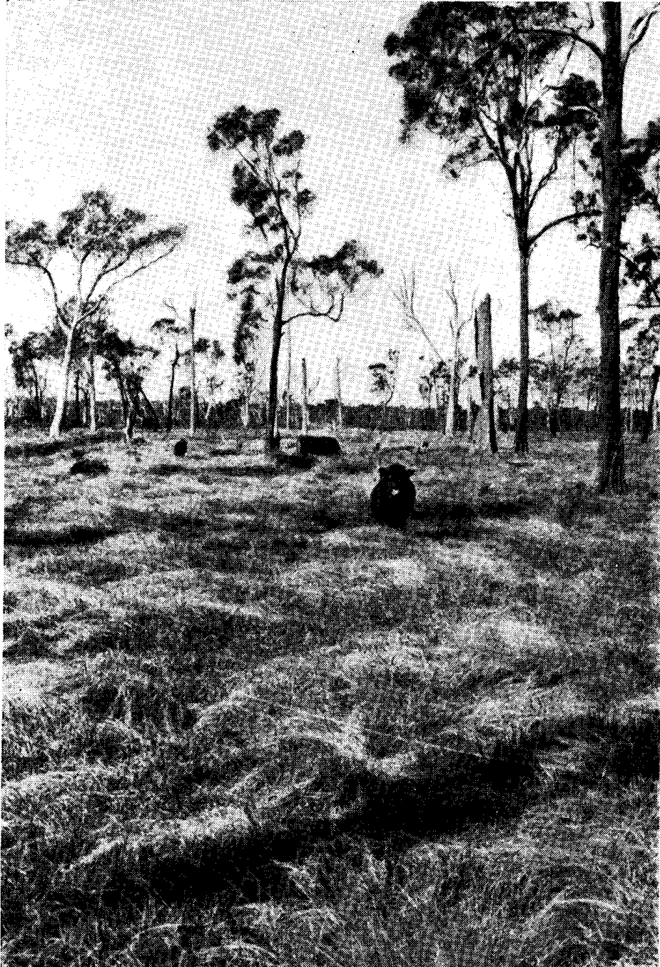
Carpet Grass typical of Mineral Deficient Areas in Sub-Region I.