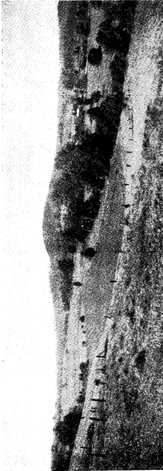
FIG. 1. View of the upper Warrell Creek district (Zone A) showing the extent of the well-drained river flats and moderate slopes typical of the area.