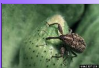
Boll Weevil (left), Asian Longhorned Beetle (right)