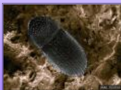
Hemlock Woolly Adelgid (left and center), Coffee Berry Beetle (right)