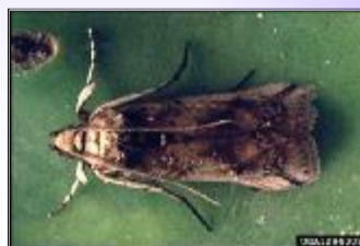
Cactus Moth (left), Emerald Ash Borer (right)

Expected management costs: This figure plots the expected management costs over the search intensity, s , for each case in the table below. The optimal search intensity, s^* (denoted by the star), is the search rate that minimizes the expected costs.