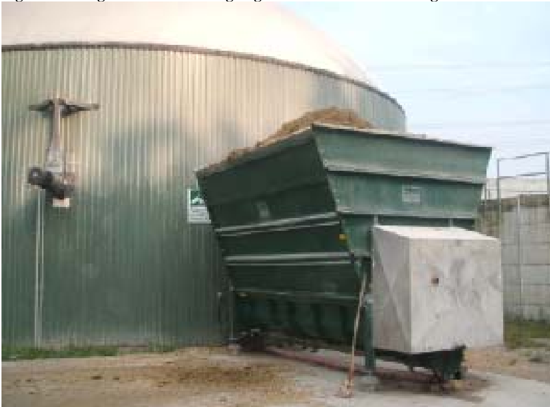
Figure 2.3: Organic material being augured into an anaerobic digester