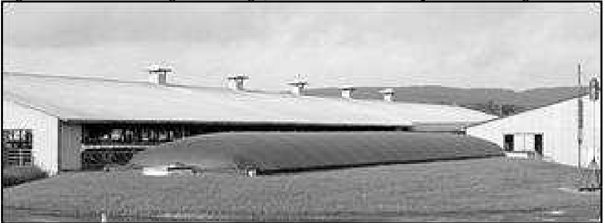
Figure 2.2: Anaerobic digestion design, membrane covered liquid manure lagoon

Source: DeBruyn, Jake, and Don, Hilborn. 2004. "Anaerobic Digestion Basics." Ontario Ministry of Agriculture, Food and Rural Affairs Factsheet, Agriculture and Rural Division. Date Accessed: November 8, 2006.