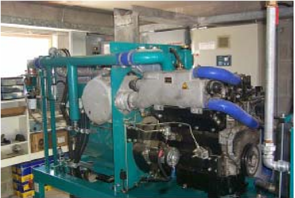
Figure 2.4: Generator operating on anaerobic digestion produced biogas

Source: Hilborn, Don. 2006. "Agricultural Byproducts to Energy Biogas Production through Anaerobic Digestion." Agricultural Waste to Energy Workshop. Abbotsford, British Columbia, July 19. Available for download at: http://www.bcbioproducts.ca/Don%20Hilborn.pdf