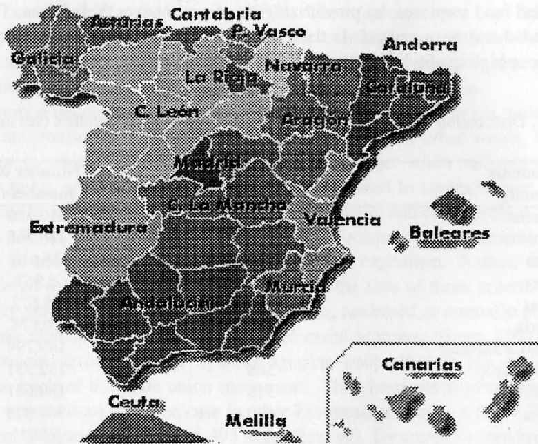
Figure 1. Map of autonomous communities of Spain

problems and those of the producers themselves. Even though this assures steady supplies to the market, this guarantee tends to be economically harmful to the cooperatives themselves, in this global situation in which food mountains abound.