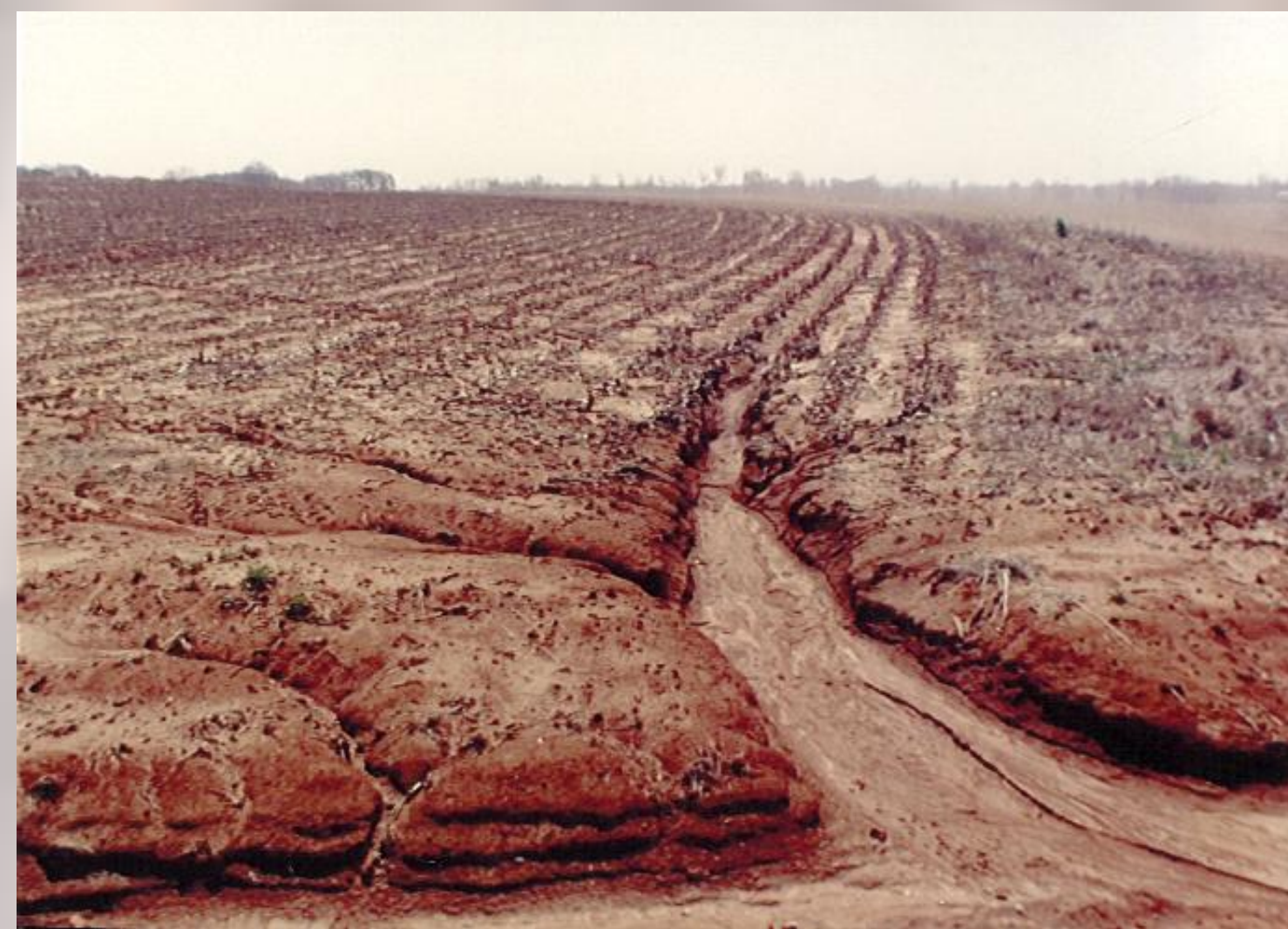
Figure 1. Benefits of cover crops are reduced soil erosion and improvements in soil productivity and health.