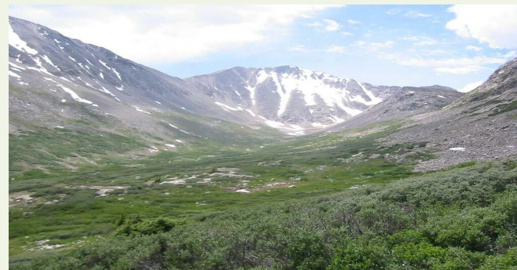
Mosquito Range, Including Mountains Democrat, Lincoln, Bross and Quandary

Quandary Peak, reaches 14,265 feet above sea level, qualifying as one of the 54 "Fourteeners," in Colorado.