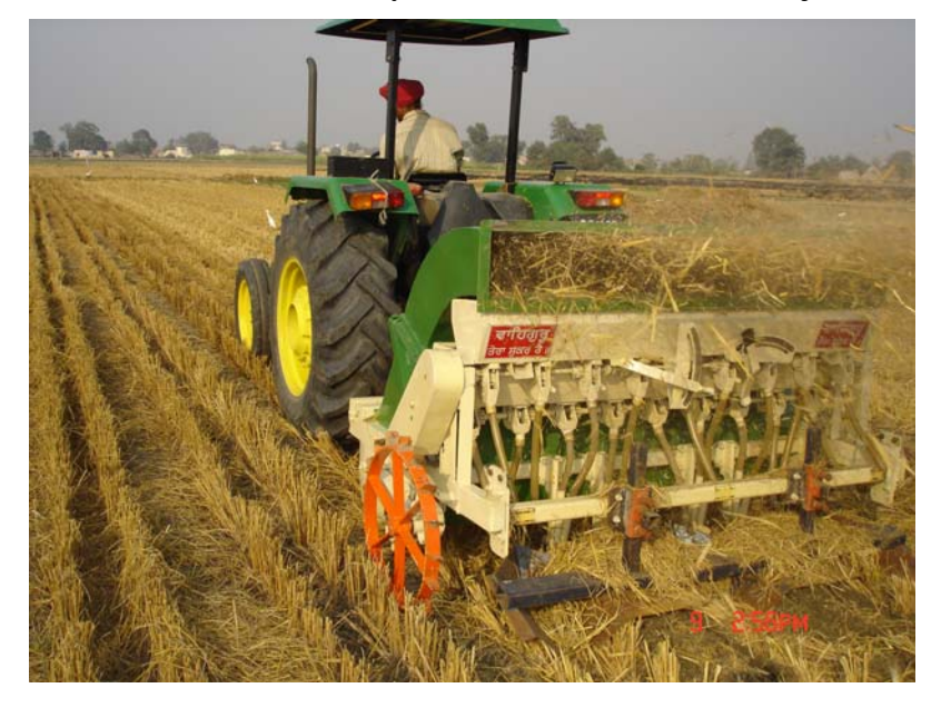
Figure 4: The Combo+ Happy Seeder

A second generation of the HS called the Combo<sup>+</sup> model was developed in 2004 by combining the forage harvester and seed drill into a single, compact, light weight (540 kg), 2 metre wide machine which can be easily mounted on a three point linkage (Figure 4). A narrow strip tillage assembly was added in front of the sowing tynes to improve seed/soil contact on the sandy loam and loam soils in Punjab.