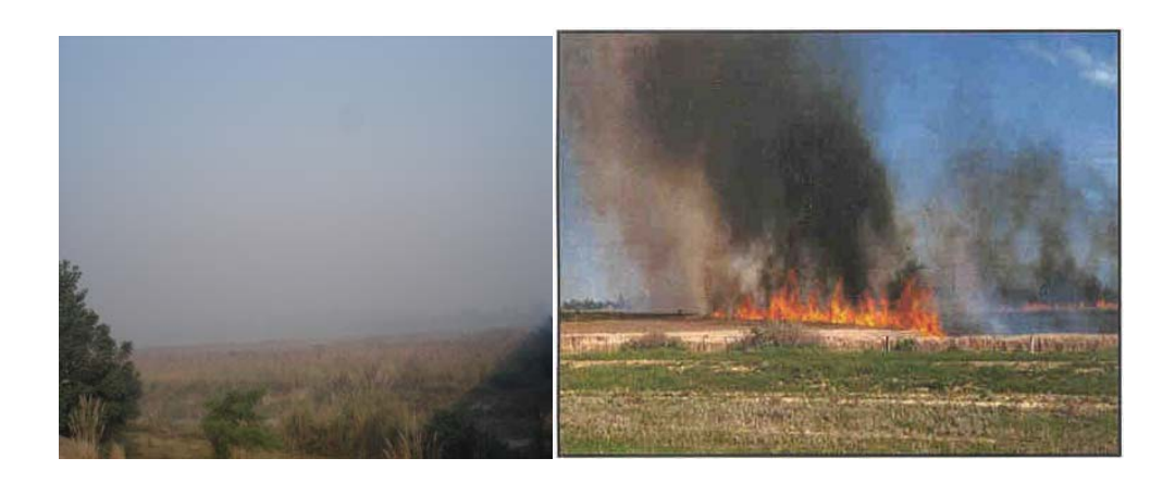
Fig 6 and 7: Air pollution from burning rice stubbles

The accidents cause loss of life and property, while the traffic delays waste time and fuel, increase transportation costs and create additional pollution from idling engines. It has been estimated that poor visibility due to smoke from stubble burning leads to 20% extra travel time (Personal communication, Assistant District Transport Officer, Sangrur, Punjab). Punjab has a total road length of around 55,000 km with more than more than 3,511 buses travelling about 1.05 million km per day plus 400,000 tractors, 100,000 trucks, 330,000 cars and 3 million scooters (Government of Punjab, 2005), so reduction in traffic delays could have significant financial and economic benefits as well as lifestyle benefits.