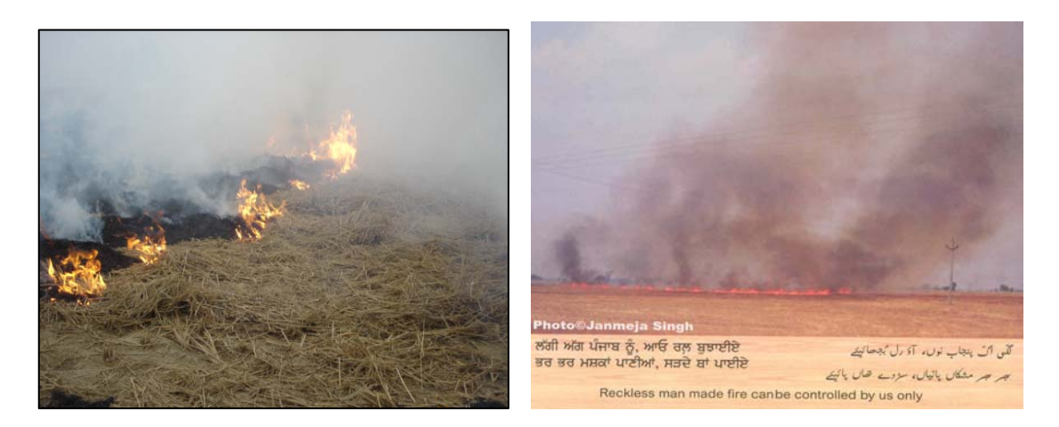
Fig 1 & 2: Burning of rice residues causing air pollution in Punjab

However, burning rice stubbles results in serious air pollution with adverse effects on human and animal health (Gupta and Sahai 2005, Lal 2006, Aggarwal 2006 and Canadian Lung Association 2007), and increased GHG emissions (Prasad 2006, Garg 2006). Burning also results in large loss of nutrients and organic matter (Table 1). After burning, the seedbed for wheat is typically prepared by 1 discing, 2 tyne harrowings and 2 planking (Appendix 1). Wheat is then sown using a tractor operated seed-fertiliser drill. However, zero tillage after stubble burning is now being adopted by many farmers. In 2005-06, around10% of the total area sown to wheat was sown using zero till machines. Less than 1% of farmers incorporate the rice straw, perhaps because more tillage operations are required than after burning (Department of Agriculture, Punjab 2005).