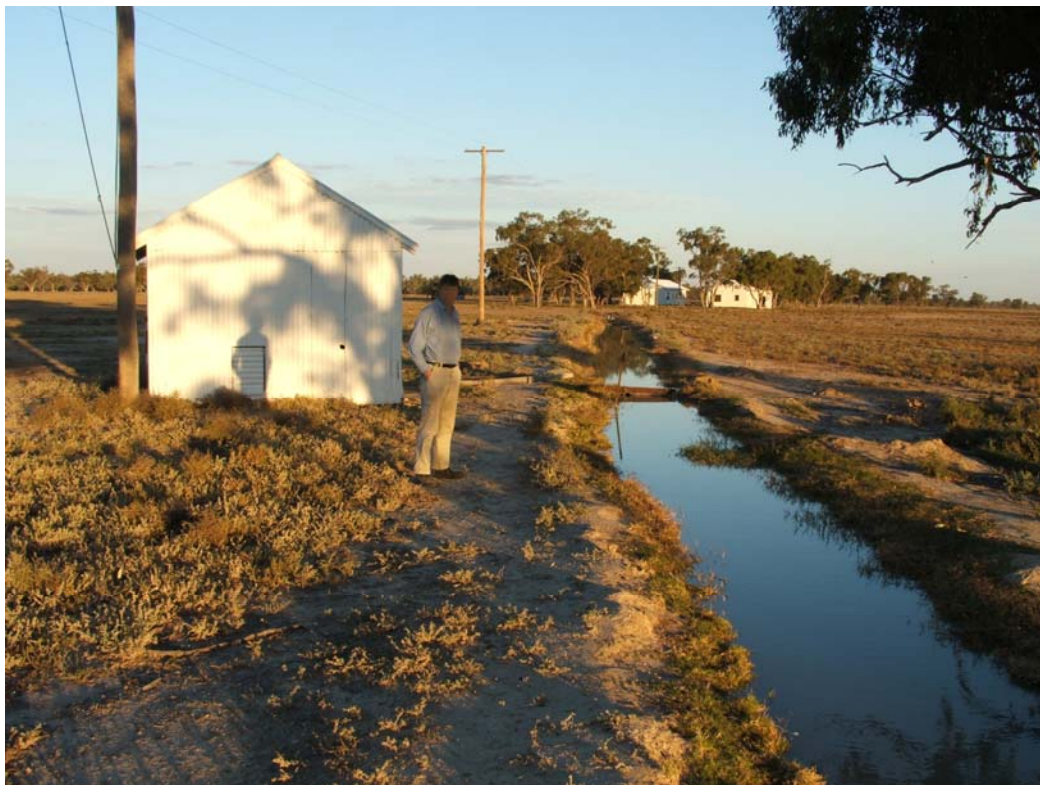
Photograph 4 Open Bore Drain Northern NSW