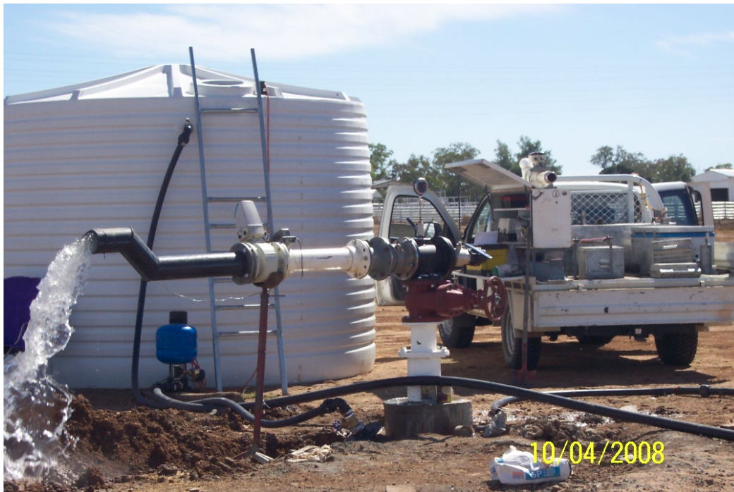
Photograph 3 Capping bore in Northern NSW