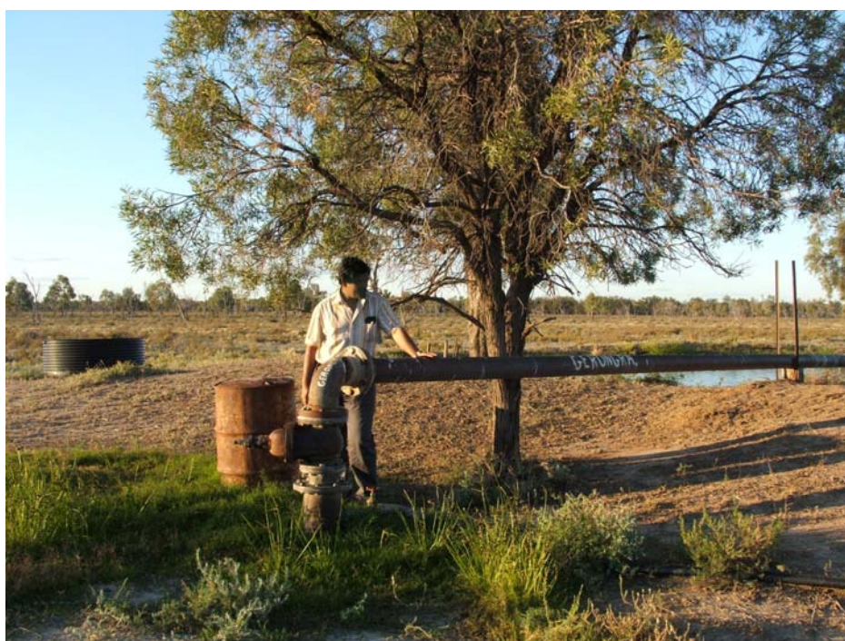
Photograph 2 Uncapped bore in Northern NSW with water flowing into drains