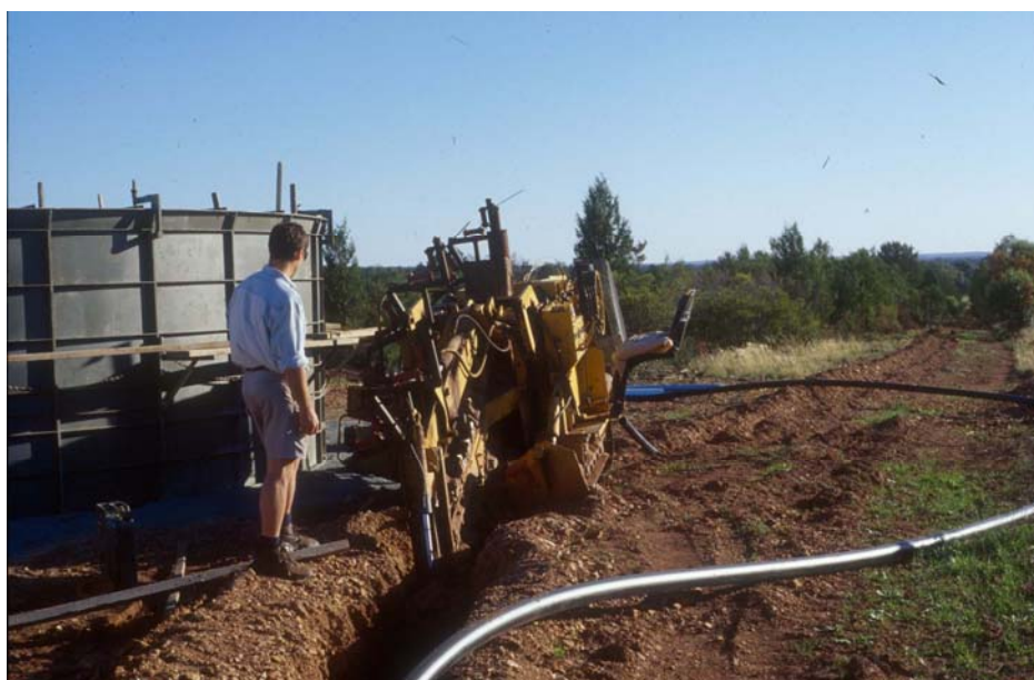
Photograph 1 Trenching for Piping in Northern NSW