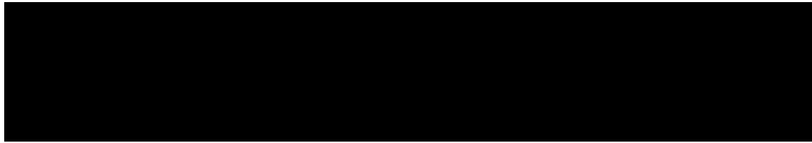
Table 5. Revenue needed to break even at 6% opportunity cost at various expense levels