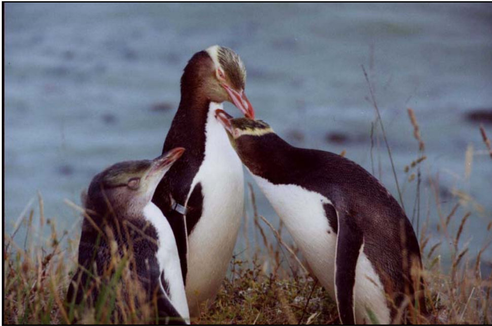
Figure 4: Yellow-eyed Penguins engaged in preening on the Otago Peninsula. This species is now the premier tourist attraction on the Otago Peninsula.