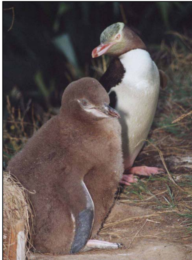
Figure 2: A Yellow-eyed Penguin with its juvenile at its nest on the Otago Peninsula