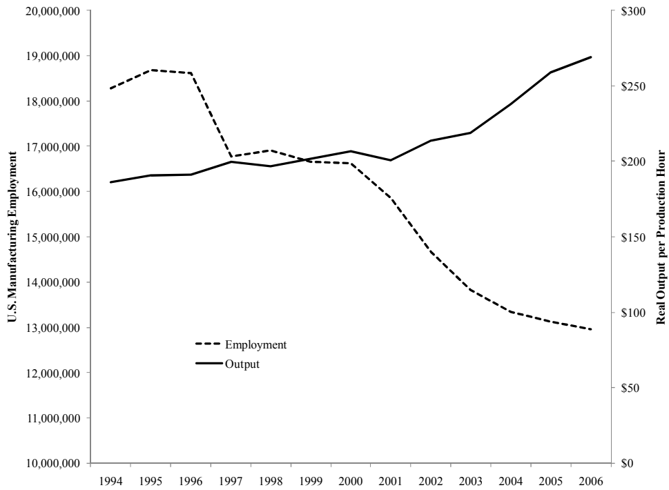
FIGURE 2. U.S. Manufacturing Employment and Output