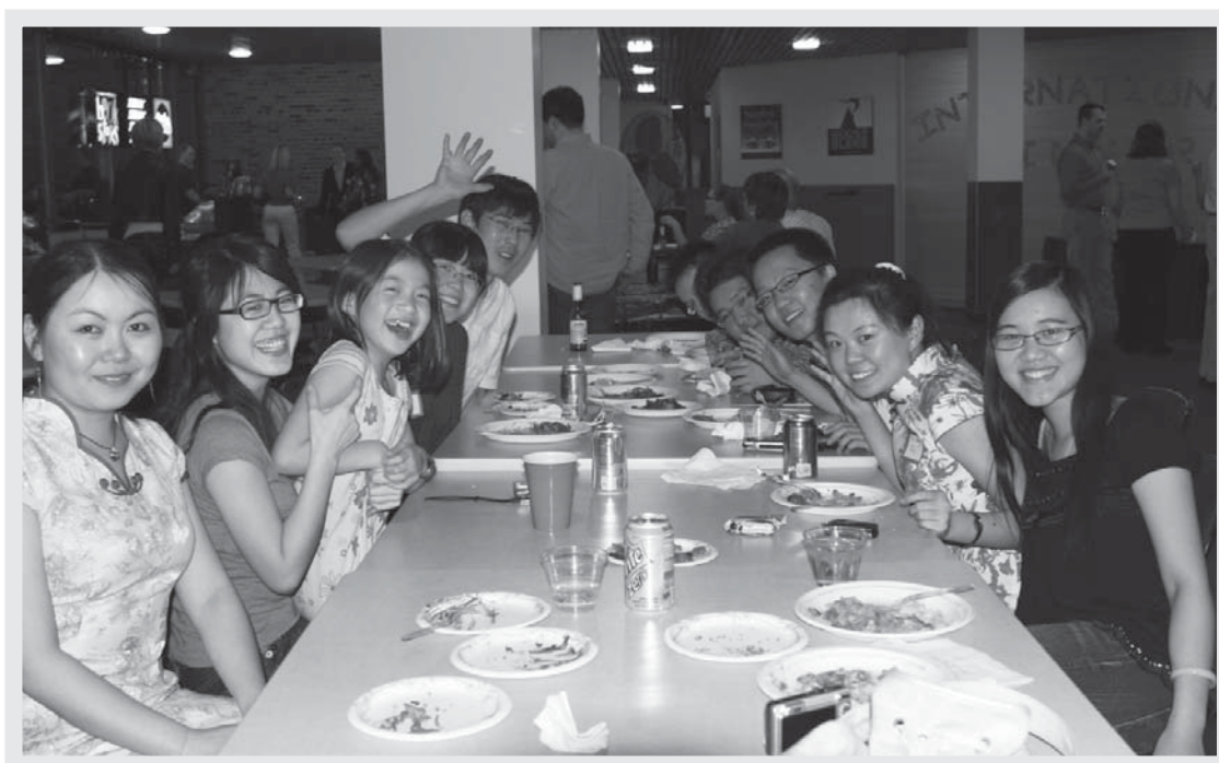
Students and their families enjoying themselves at the annual International Dinner in April 2009.