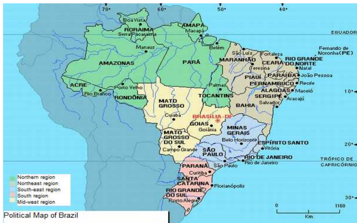
Figure 2 – Political Map of Brazil divided by region.

The South region, in spite of being the smallest Brazilian region (6.75 % of the territory), it is the main agribusiness production region and the second largest producer in terms of the gross production value in 2001. Because of its different climate from the other regions, predominantly subtropical, other cultures that need a more temperate climate can be cultivated, as is the case of wheat, among other farming goods (agr) and rice (pdr), and it mainly excels in the production of meats (oap), soy (osd), food goods (foo), and corn and grains (gro); it also excels in the clothing and shoes (wap), and textile (tex) industries.