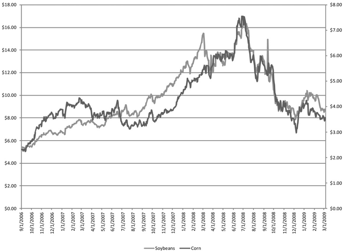
Figure 2. Nearby Futures Prices for Corn and Soybeans

spring/summer of 2008. Note from Figure 2 that one of the more extreme moves in corn and soybean futures prices occurred over a 6-week period. While the Irwin, Sanders, and Merrin (2009) study provides solid evidence that there has not been a long-run, sustained speculative price impact, it does not really address the assertion that short-run price movement is affected by speculative behavior, or that speculators' market activities impact overall market stability (i.e., the higher moments of the price distribution).