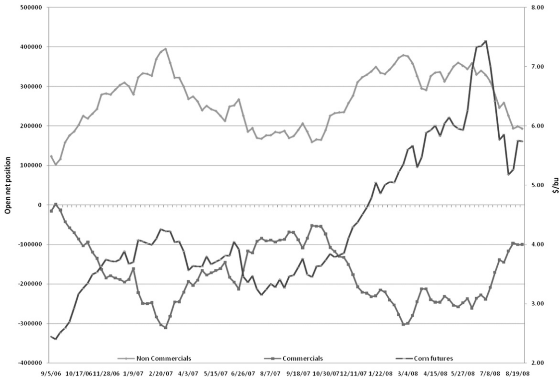
Figure 1. Net Futures (Long – Short) of Commercial and Noncommercial Traders Versus Nearby Corn Futures Prices

Irwin, Sanders, and Merrin (2009) argue much of the “evidence” in favor speculative price impacts comes from the casual observance of simple correlations (Figure 1), not from a rigorous test of causality. How do we know that speculators led, as opposed to followed, the increase in prices? Most of the evidence provided by Irwin, Sanders, and Merrin (2009) does point to a lack of a substantive