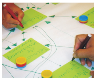
(ii) Placement of influence towers and drawing of 'smiley' faces to indicate stakeholder attitude to the project

Day 3: Developing the outcomes logic model and an M&E plan In the final part of the workshop, participants distil and integrate their cause-effect descriptions from the problem tree with the network view of project impact pathways into an outcomes logic model . This model describes in table format (see Table 1) how stakeholders (i.e. next users, end users, politically-important actors and project implementers) should act differently if the project is to achieve its vision. Each row describes changes in a particular actor's knowledge,