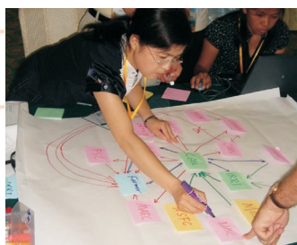
(i) Drawing a network map