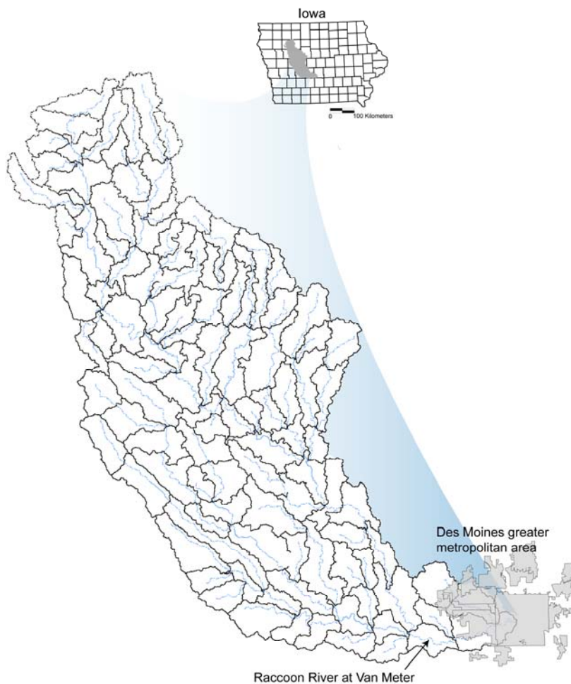
Fig. 1 Location of the Raccoon River Watershed and delineated subwatersheds

combine the genetic algorithm optimization technique with the calibrated SWAT model for the watershed. Objective functions were built to cost-effectively reduce loadings of two nutrients, nitrogen and phosphorus, at the watershed outlet. The goal of this research is to identify least-cost combinations and placements of conservation practices in the region to achieve nitrogen and phosphorus reductions for the Raccoon River Watershed. Conservation practices chosen include reduced fertilization of row crops, three reduced tillage options, contour farming, installation of grassed waterways, and land retirement. The development of a full frontier will allow policymakers and stakeholders to explicitly see the trade-offs between cost and nutrient reductions as well as the potential trade-offs between the two nutrients.