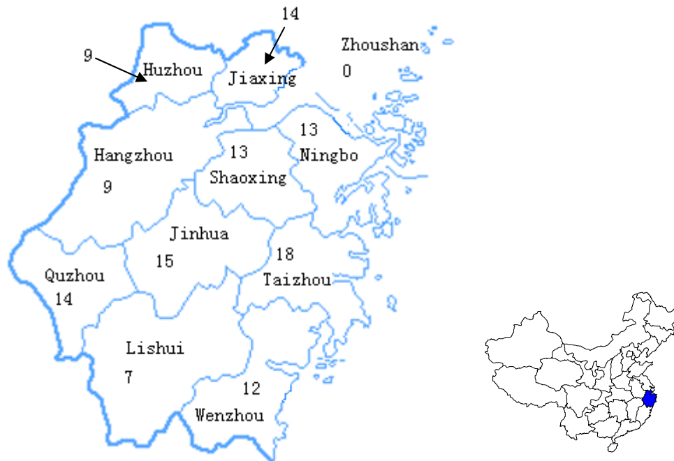
Figure 2 Valid respondents in each cities of Zhejiang Province

valid questionnaires were returned during the period September 2006 to March 2007. Figure 2 illustrates the number of valid questionnaires received from each city across the province.