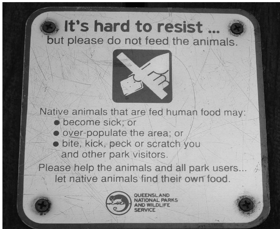
Figure 6: Warning from Queensland Parks and Wildlife Service not to feed wildlife at Green Mountains

and this aspect is popular for photographing. Birds continue to be fed at O'Reilly's and in the picnic area and surrounding area of the park despite signs by the Queensland Parks and Wildlife Service warning against the feeding of wildlife (see Figure 6).