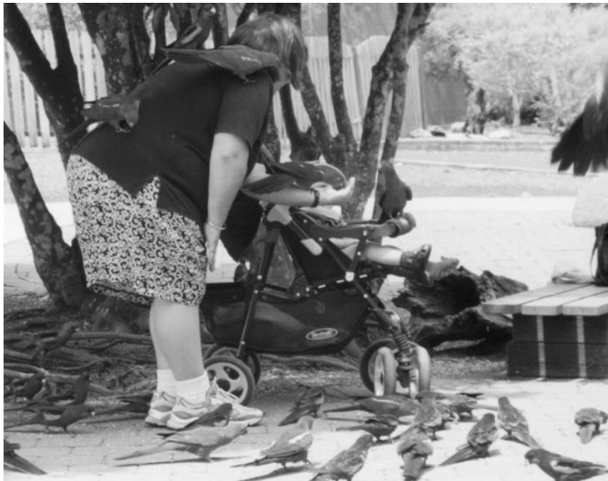
Figure 4. Mother and child in physical contact with colorful parrots at O'Reilly's

Thus it appears that different types of visitors believe that birds are important at this site for different reasons. The next section should help elucidate that situation.