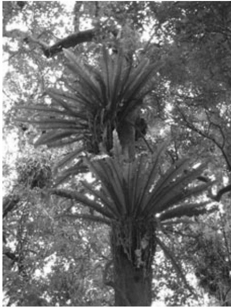
Figure 2: Rainforest is the prime attraction to LNP