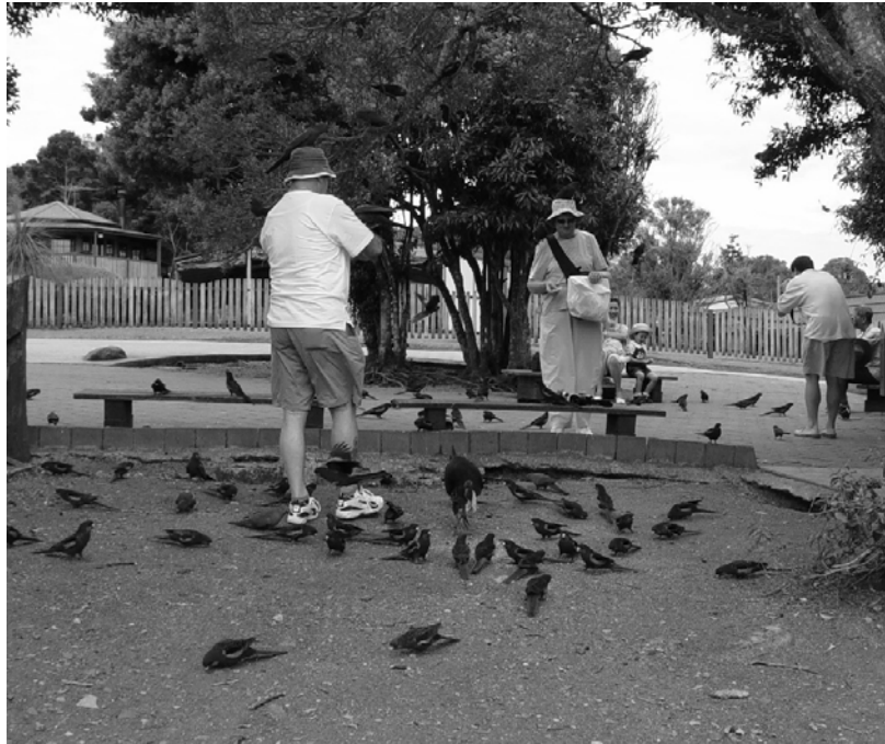
Figure 7: Many visitors enjoy feeding colorful birds at the O’Reilly’s site and having physical contact with these birds

Using logit regression analysis, let us consider the factors that increase the likelihood of a respondent saying that diversity of birds of this site is important. We also do this to identify factors that increase the likelihood of a respondent saying that physical contact with birds and the presence of colorful birds are important. These results can then form the basis to differentiate between the groups.