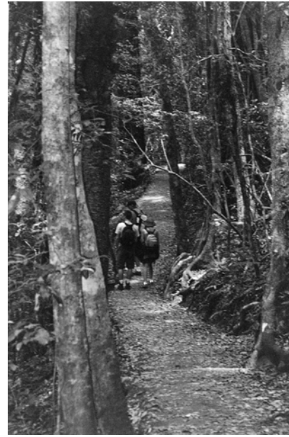
Figure 3: The survey site is a good starting point for bushwalks – walkers on the Border Track

In order to determine the type of visitors who are likely to say that the presence of birds is important we conducted logit and probit regression analyses. The results of these two analyses are shown in Table 2. For the purpose of this analysis, responses of ‘important’ or ‘very important’ were combined (coded as one) and ‘unimportant’ was coded as zero. Table 2 lists only the statistically significant independent variables and their levels of statistical significance.