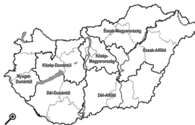
Figure 1. Regions of Hungary, Source: KSH

Közép-Magyarország - Central-Hungary (Budapest, Pest County): 38.5% of economic organizations work in this territory, similarly to nationwide data, their number showed a 4.4% increase comparing to the figure of early in the year. Industrial output increases dynamically. Large part of total industrial production (28%) comes from here. The level of unemployment is the lowest in the country (4.4%), however, there are several districts in the capital (eg. Józsefváros), with the indicators worse than the above mentioned.