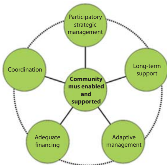
FIGURE 3. Principles at intermediate level.

Key sets of intermediate-level actors include local government, sectoral line departments, local public and private service providers, irrigation committees of larger schemes, donors, financiers, local NGOs and CBOs like associations or farmer networks. Particularly important is the district or municipality level at which local civil servants and elected officials work and plan together (Schouten and Moriarty 2004).