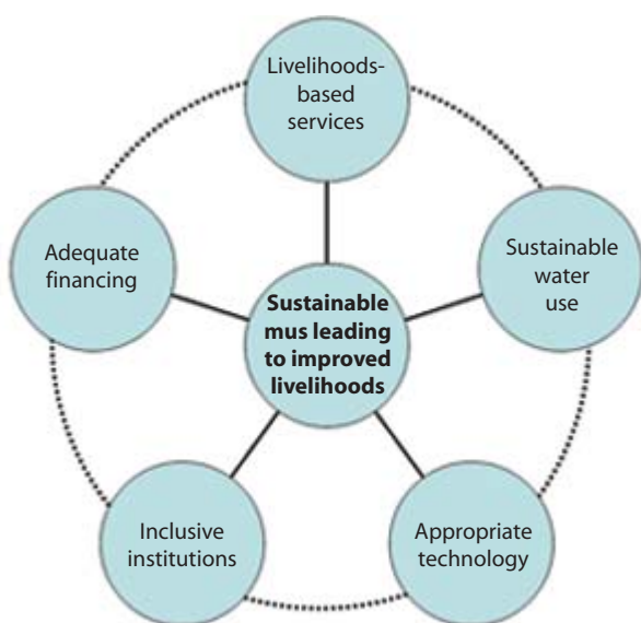
FIGURE 2. Community-level principles.

considerably higher, certainly in the initial pioneering stage of methodology and skill development. However, good investment in capacity building at this stage has been widely demonstrated to bring benefits in terms of increased ownership and sustainable management.