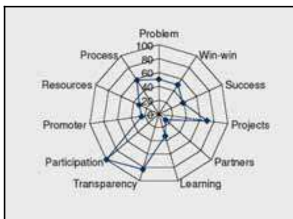
Figure 3. A fictitious example of a net diagram generated by the tool