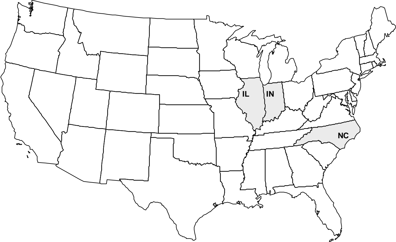
FIGURE 36. REPRESENTATIVE FARMS PRODUCING HOGS