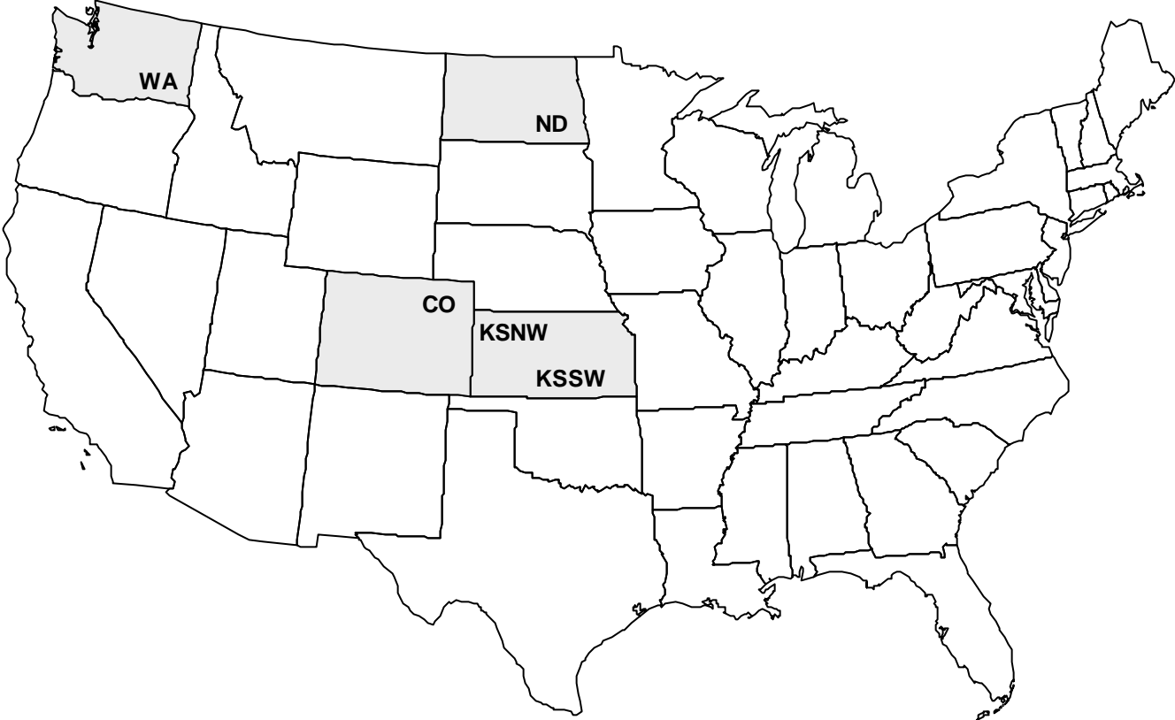
FIGURE 8. REPRESENTATIVE FARMS PRODUCING WHEAT