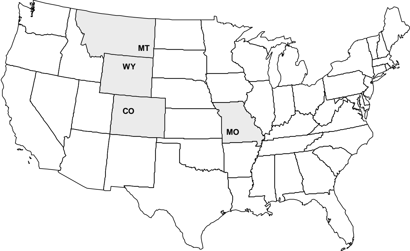
FIGURE 33. REPRESENTATIVE FARMS PRODUCING BEEF CATTLE