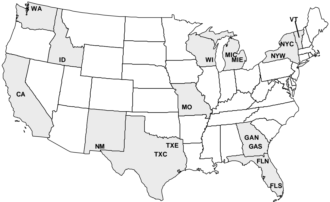
FIGURE 23. REPRESENTATIVE FARMS PRODUCING MILK