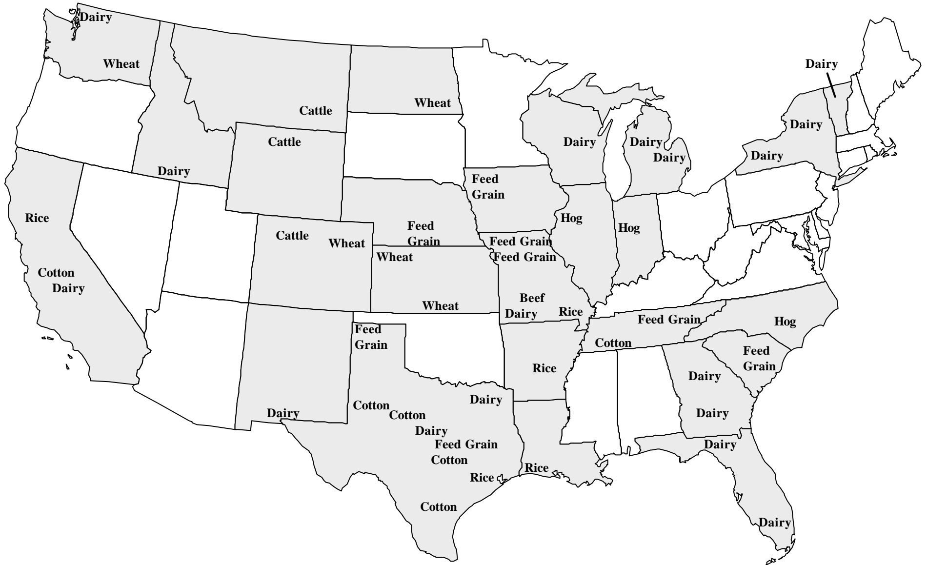
Figure 1. Representative Farms and Ranches