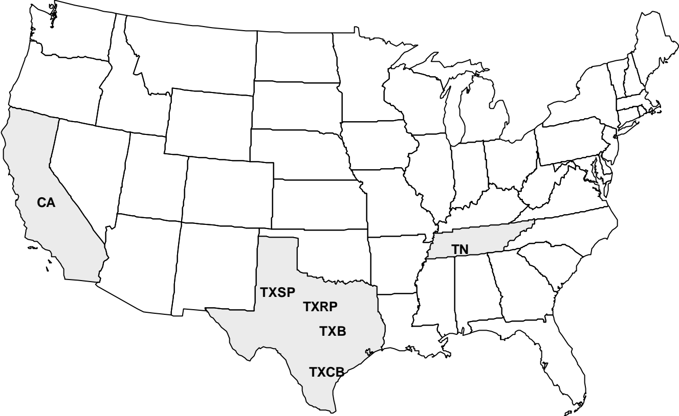
FIGURE 13. REPRESENTATIVE FARMS PRODUCING COTTON