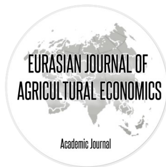
Table 2: Technical efficiency of regions