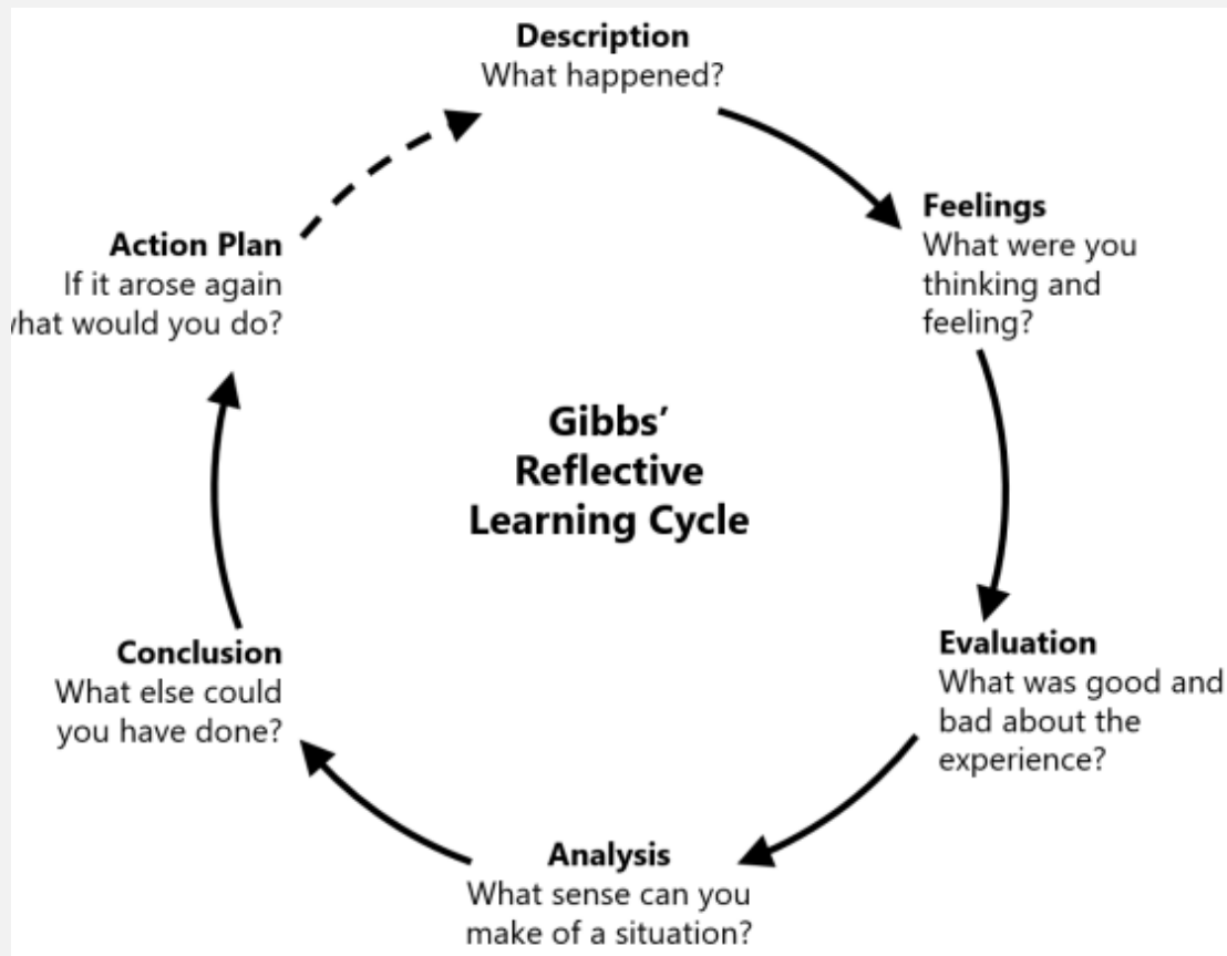
Figure 2: Gibbs' Model.