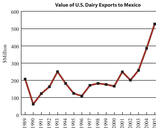
U.S. Dairy Exports to Mexico, 2001–2005

Cross-border dairy trade is a small part of total agricultural trade between the two countries, which is much more balanced. In 2005, the U.S. sold about $9 billion in farm products to Mexico, with dairy accounting for only 5.5 percent of this total. Corn, soybeans, and livestock and meats represented about two-thirds of the export value. U.S. agricultural imports from Mexico in 2005 were about $8 million, three-quarters in the form of fresh fruits and vegetables. Dairy was only 1 percent of the total value.