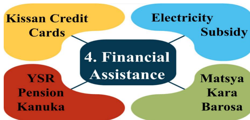
Fig. 2. Financial Interventions provided by Fisheries department of Andhra Pradesh