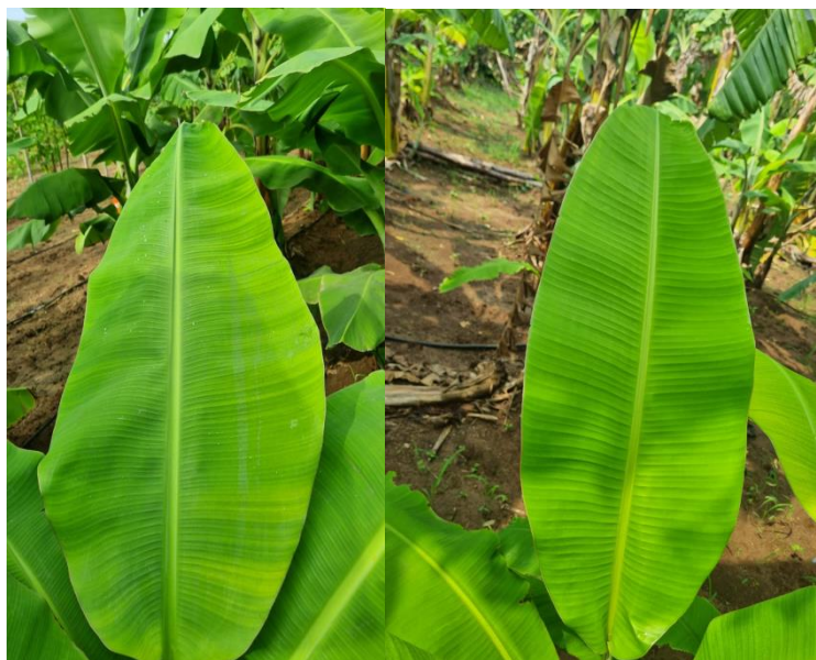
Fig. 2. Healthy leaves of banana

During the experiment raw data is identified and instructive labels are added. The categorization label is the one that has the highest chance of being utilized (completely linked layer). After completing the first training phase, load the training images, configure the learning rate, run the optimizer and creates the training convolution model.