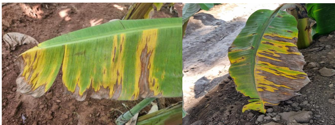
Fig. 1. Image of Sigatoka leaf spot

There are many layers in a convolutional neural network, including the input layer, the convolutional layer, the pooling layer, and the fully connected layers. In order to extract features from the input image, the convolutional layer applies filters. The final prediction is made by the fully connected layer after the image has been downscaled by the pooling layer to minimize computation time.