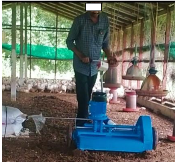
Fig. 2. Raking of litter using poultry litter raking machine

Similarly, the height of the wheel to the floor was also adjusted to have uniform coverage depth. The prototype machine thus designed was tested in the poultry farm of the innovator for three years (12 growing cycles). After every year, necessary modifications were made to the design to arrive at the final prototype.