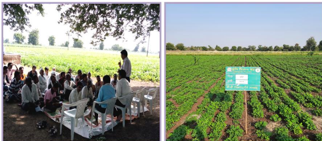
Fig. 2. Group meeting of FLDs farmers with KVK Scientist