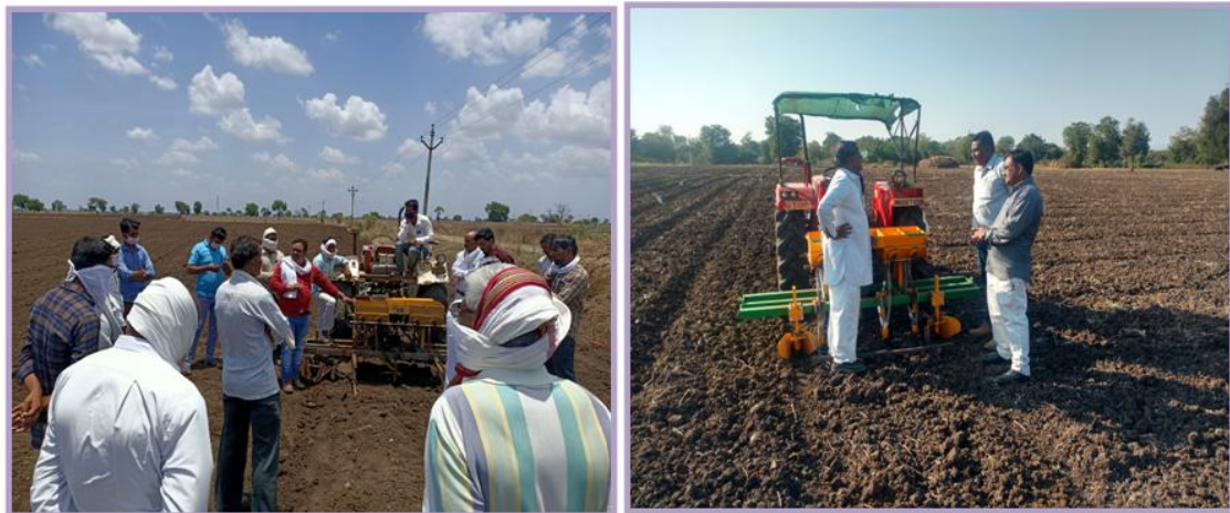
Fig. 1. Training Programme of FLDs Farmers on BBF Method and Sowing