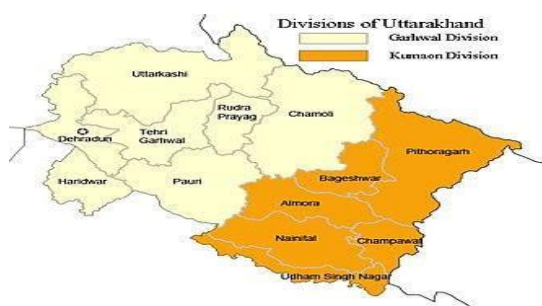
Fig. 1. District wise map of Uttarakhand State