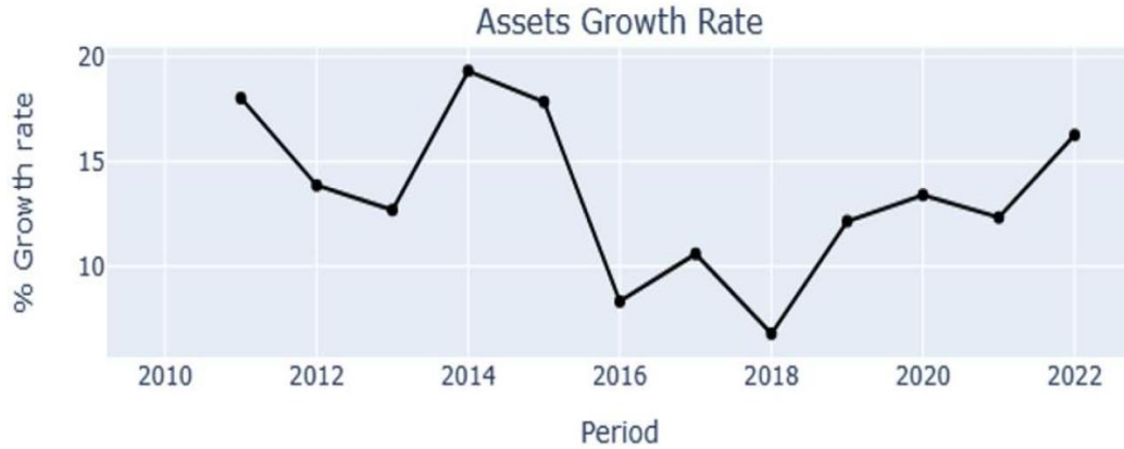
Fig 2: Trend of Asset Growth Rates for NSE 20, 2011-2022 Source of data: Wall Street Journal and African Financials (2023)

The highest NSE 20 asset growth of around 19 percent was attained in 2014 while the lowest growth of 7 percent was recorded in 2018. Clearly, the growth rates in asset were higher when stock returns volatility was relatively calm, and the slack growth coincided with the rough period. From 2019 to 2022, growth picked up an upward trajectory – resilient to the devastating effects of COVID-19 pandemic.