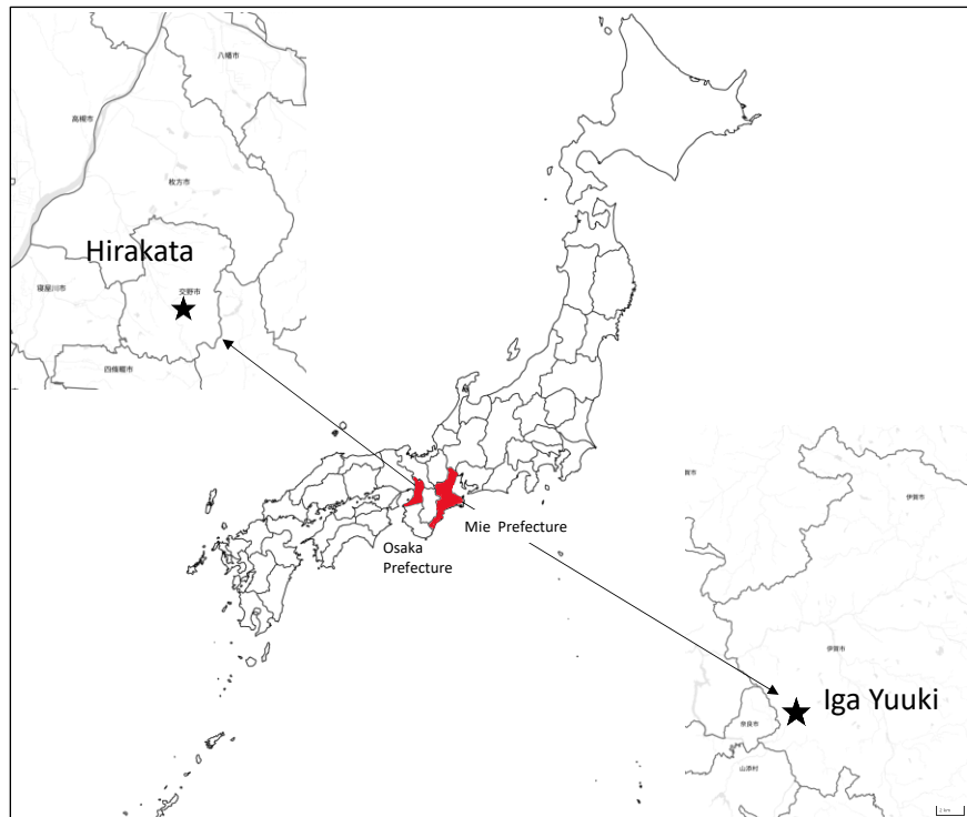
Figure 2. Map of Case Study Sites (Hirakata in Osaka Prefecture and Iga Yūki in Mie Prefecture)

This paper focuses on two case studies that are based outside of the North American and European context. Additionally, these case studies focus on AFNs that formed as noncapitalist economic practices with a strong movement orientation and later transitioned their leadership towards a younger generation. I analyze the motives and shifts in awareness of those who participate in teikei groups today, particularly those in paid positions. Both groups are within the Kansai region of Japan in Osaka and Mie Prefectures (see Figure 2). I conducted data collection (e.g., participant observation of meetings and delivery routes and text analysis of annual reports, weekly newsletters, and meeting records), and carried out interviews between