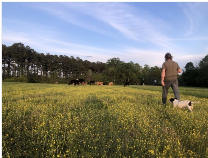
Figure 5. On Ran-Lew Dairy Farm