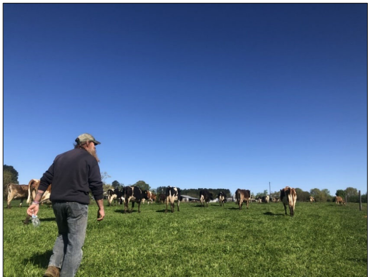
Figure 2. On Ran-Lew Dairy Farm