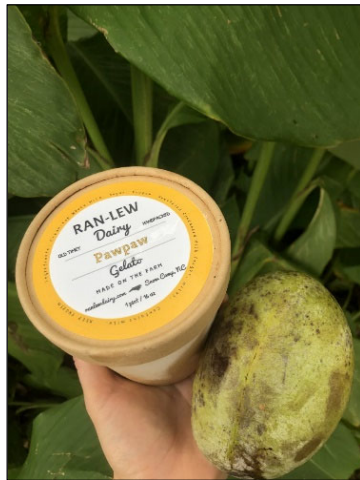
Figure 3. Pawpaw Gelato from Ran-Lew Dairy