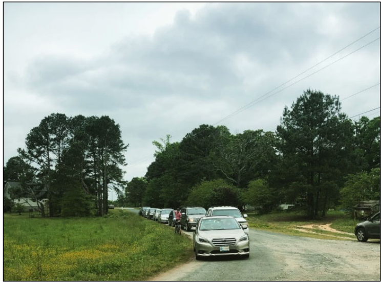
Figure 1. Ran-Lew's Socially Distanced On-farm Pick-up System

Ran-Lew is well positioned for another unique reason: it is vertically integrated. That is, it is fully in charge of its entire supply chain. The company raises its own cows, processes its cows' milk, and