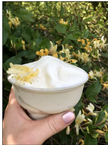
Figure 4. Honeysuckle Ice Cream from Ran-Lew Dairy