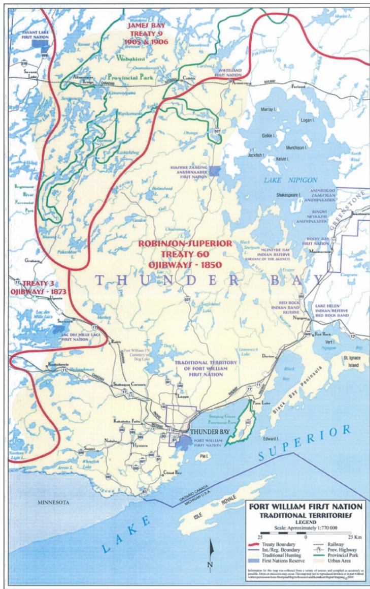
Figure 1. Fort William First Nation Traditional Territory