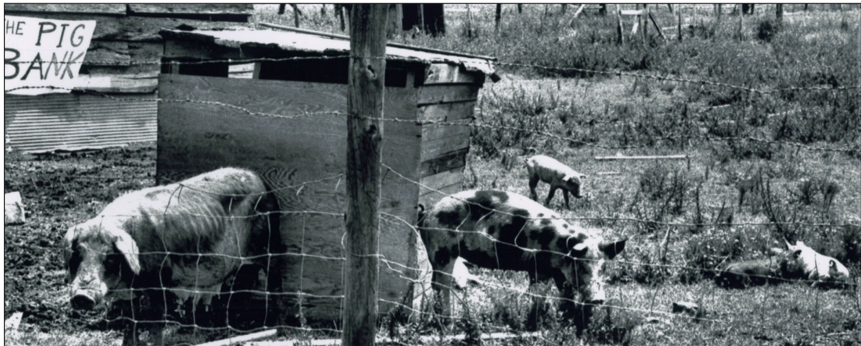
The Pig Bank at Freedom Farms.

FFC and other agricultural cooperatives were founded on the notion that growing food would be a strategy toward self-determination and self-reliance. They offer today's urban farmers an idea and a strategy. Based upon my own analysis of over 40 Black agricultural cooperatives, the approach that FFC and other cooperatives enacted demonstrate the theoretical framework of Collective Action and Community Resilience (CACR), with the strategies of commons as praxis, economic autonomy, and prefigurative politics. 2 These overlapping strategies encompass the ideological/social, political, and economic aspects of community