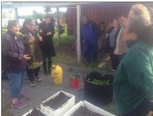
Figure 2. The garden as a classroom: Kumara workshop conducted as part of the Parihaka exchange.

speak the Māori language in order to strengthen cultural awareness and identity, and again stay true to the tenants of kaupapa Māori, which emphasize the use of the Māori language and cultural revitalization. Given that the exchange was during a monthly hui usually held to commemorate Te Whiti and Tohu, Māori peace activists who practiced food cultivation as a way to claim land back from European settlers, this planting was especially significant. We also shared seed from each other's gardens, presentations, and photos from each of the women's projects, common problems and solutions encountered in the gardens, stories, and experiences. The village hui was for three days, during which we stayed collectively at the marae. Visitors from all over the country were there, including a school group with whom the women were also able to share their stories and experiences. The women also expressed the desire to continue the exchanges informally, without funding, by driving themselves to visit the other initiatives involved with the study.