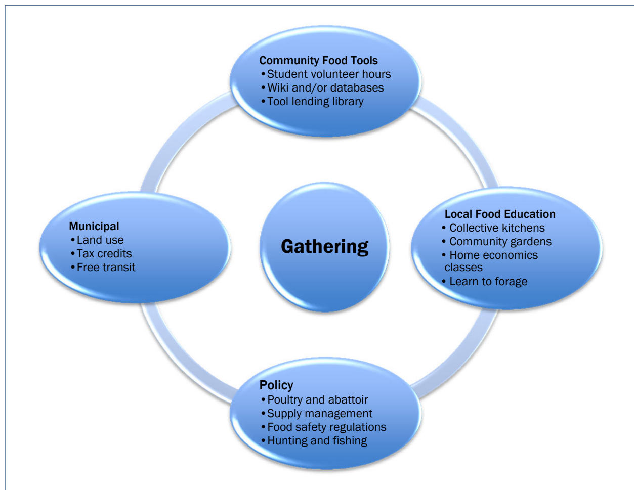
Figure 2. Enhancing the Local Food Movement: Summary of Participant Responses from the World Café Exercise

four themes. Examples include barriers and solutions to increasing the use of collective kitchens; participation in community gardens; enhancing the viability of farmer incomes; and barriers and food-related policy, including municipal bylaw, zoning, and policy issues.