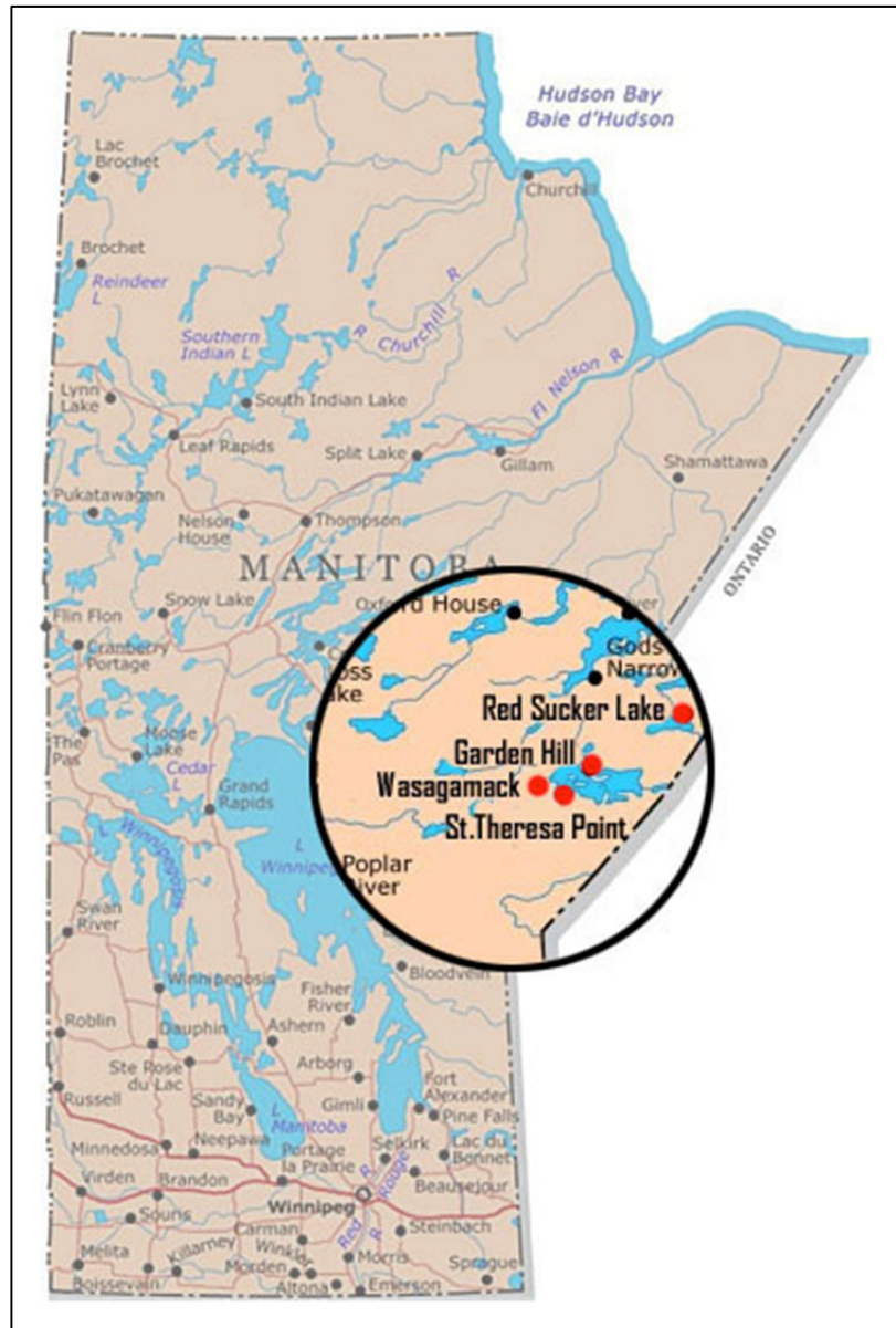
Figure 1. Location of Garden Hill First Nation on Island Lake in Manitoba