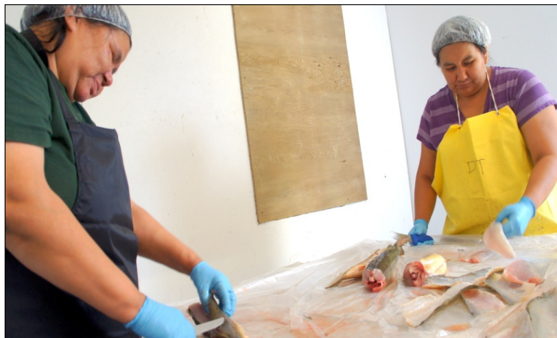
Figure 3. Garden Hill First Nation's Community Members Who Have Food Handling Certificates Fillet Fish at the ILOC Fish Processing and Packaging Facility

Food security occurs “when all people, at all times, have physical and economic access to sufficient, safe and nutritious food that meets their dietary needs and food preferences for an active and healthy life” (Food and Agriculture Organization of the United Nations [FAO], 1996, p. 1). To get a fine-grained view of household food security we conducted surveys with 10 randomly selected fisher households and 41 nonfisher households in GHFN for comparison using a validated instrument from Health Canada (2007). We used the survey to estimate both the prevalence of food insecurity and its severity (Bickel, Nord, Price,