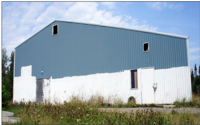
Figure 2. The Fish Processing Plant in Garden Hill First Nation, Home of Island Lake Opakitawek Cooperative Limited