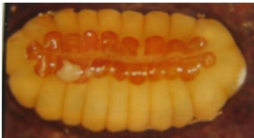
Fig. 2 Twenty loculi ovary of Hevea brasiliensis

The rubber tree has experienced a change in flower structure due to climate change. This is however a mutant and evolution is such that if a mutant enjoys an advantage, it may become a variant among the species. Species variant has its consequences, especially in agriculture where acceptance is a major factor. There were twenty loculi ovary arranged in linear rows of ten loculi each (Fig. 2), in contrast with the radial arrangement of three, four or five loculi ovary Omokhafa et al. (2023). Flower phenology is such that the rubber tree flowers once in West Africa, from February to April each year, but twice in Asia, from February to June and August to October, each year